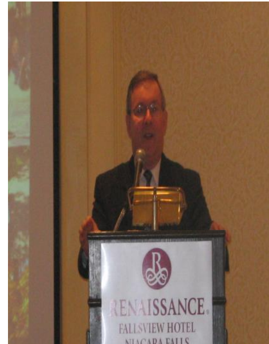
Minister Bradley MTO addresses OTC in May 2007